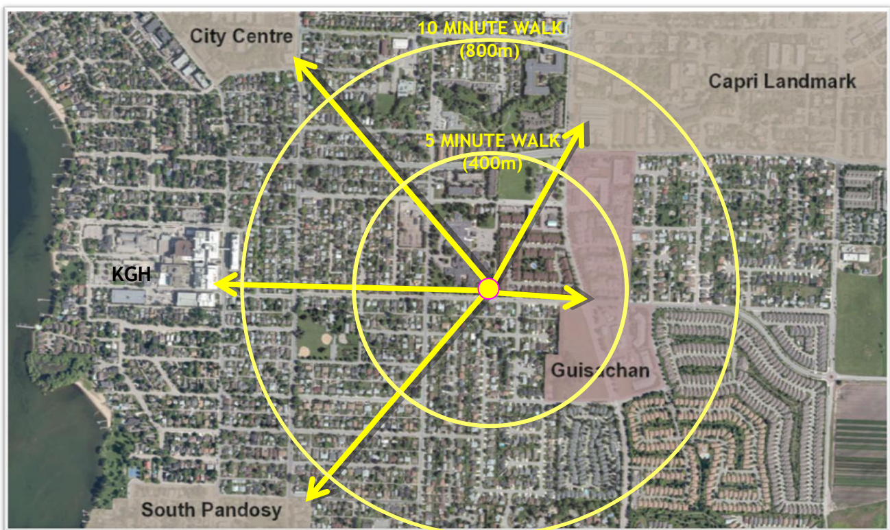
Figure 2: Proximity to Services 990 Guisachan

There is potential for a live/work/play opportunity on the subject property as the property is situated central (appx 900 m) to City Centre, Capri Landmark and South Pandosy Urban Centres as well as Kelowna General Hospital.