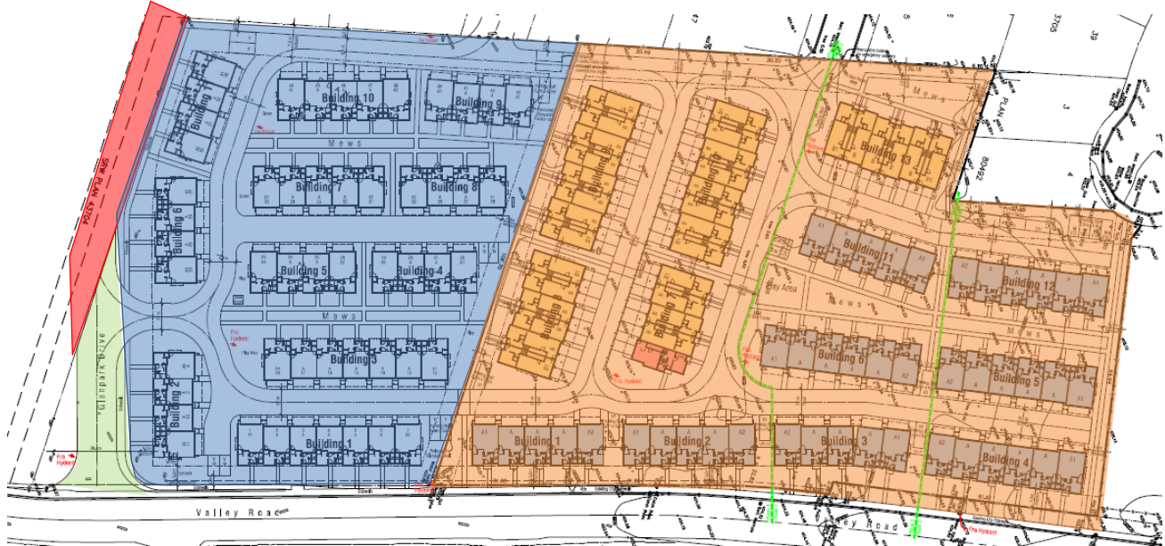
Figure 1 – Orange indicates the subject proposal site; Blue indicates the previously approved phase 1 of the development. Green indicates the portion of Glenpark Drive to be constructed and Red indicates the future Glenpark Drive to be constructed as part of the adjacent future development.

Staff have reviewed this application and it may proceed without affecting either the City's Financial Plan or Waste Management Plan.