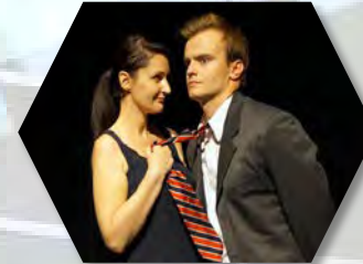
New Vintage Theatre