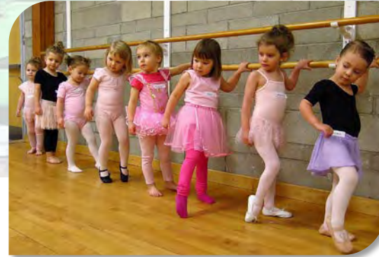
Ballet & Creative Movement