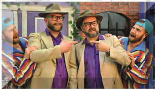
Theatre Kelowna Society