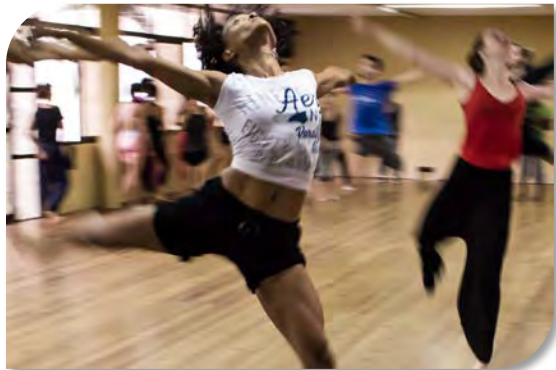
Musical Theatre Jazz