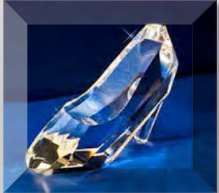
A 1970's Cinderella

74 performers • 31 local performers • 6,549 in attendance