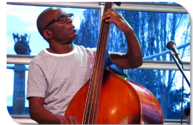
School of Blues