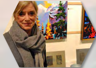
La Luz Glassworks Studio