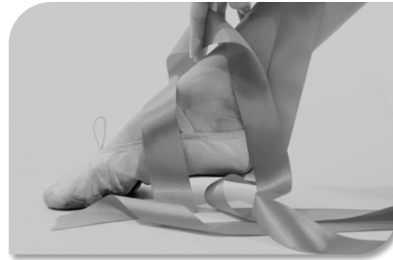
Adult Lyrical Ballet