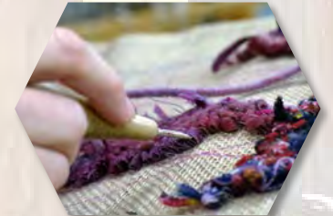
Ponderosa Spinners Weavers & Fibre Artists