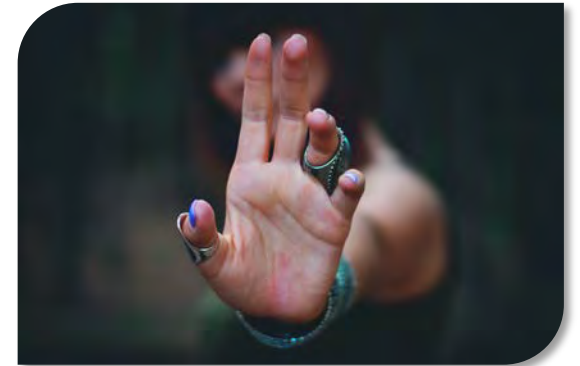
Qi Gong — Relax & Recharge