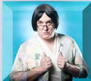
God is a Scottish Drag Queen