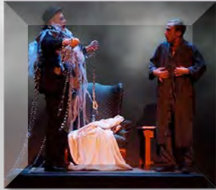
A Kelowna Christmas Carol