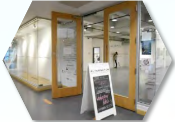
Alternator Centre for Contemporary Art