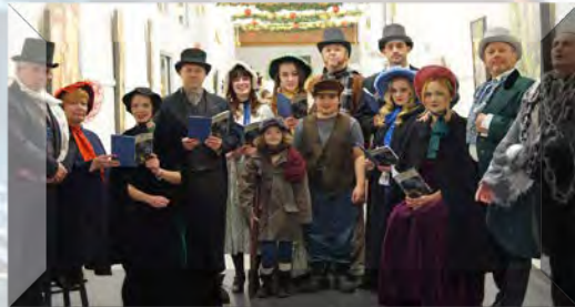
New Vintage Theatre