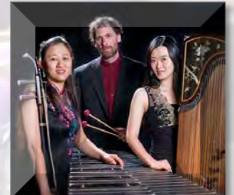
Music of the Heavens