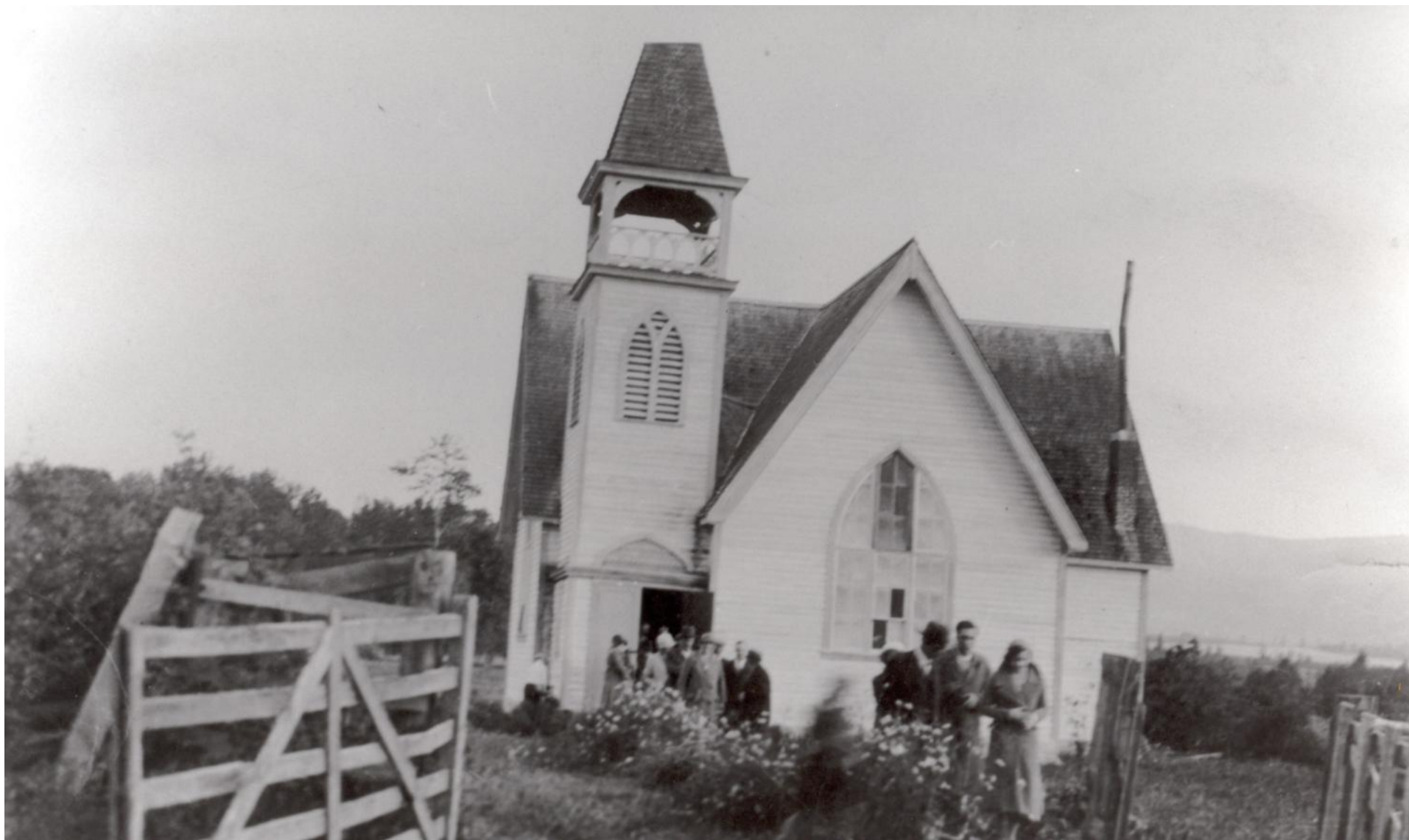
Benvoulin (Bethel) Church, c. 1920