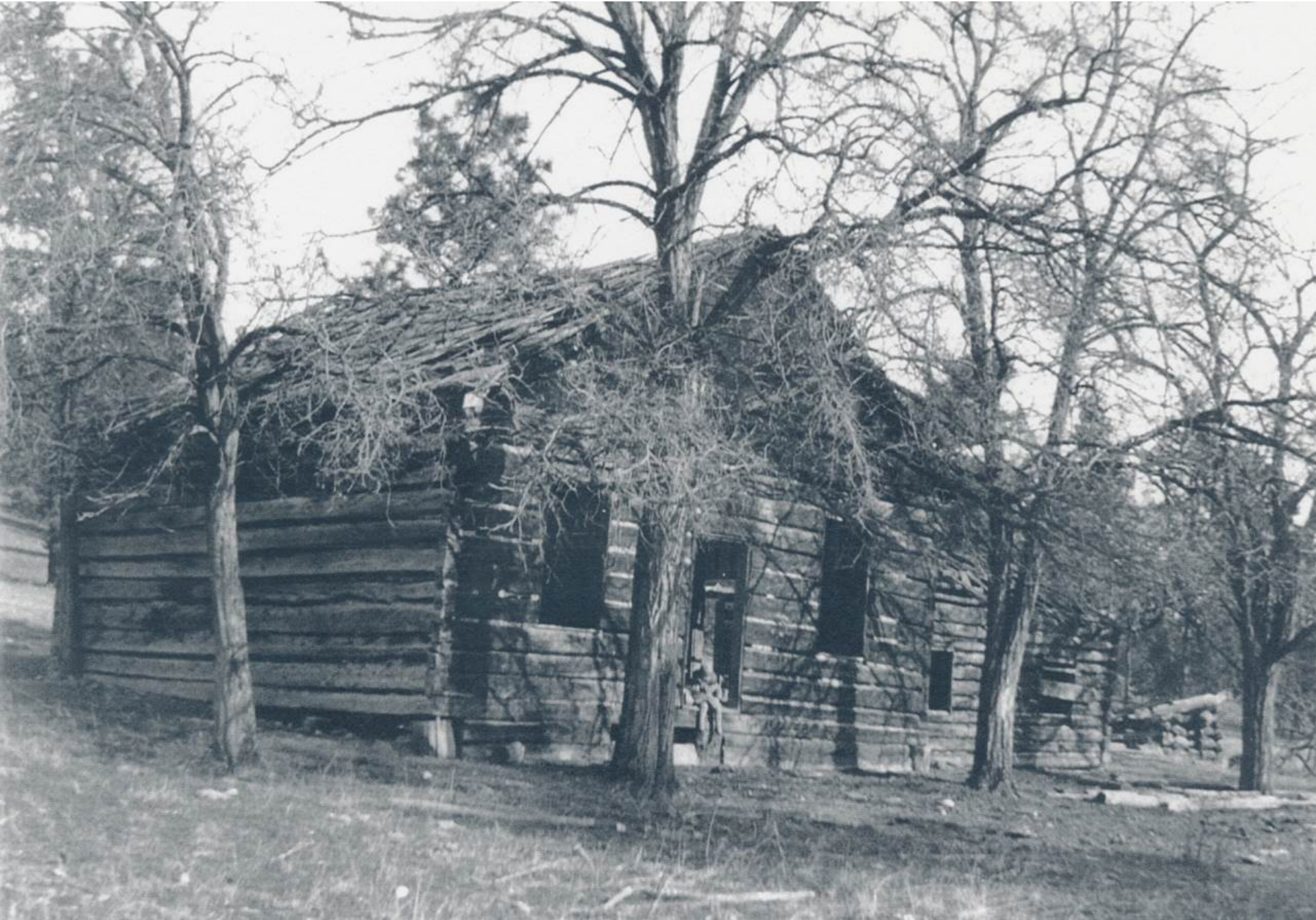
Allison Cabin, West Kelowna