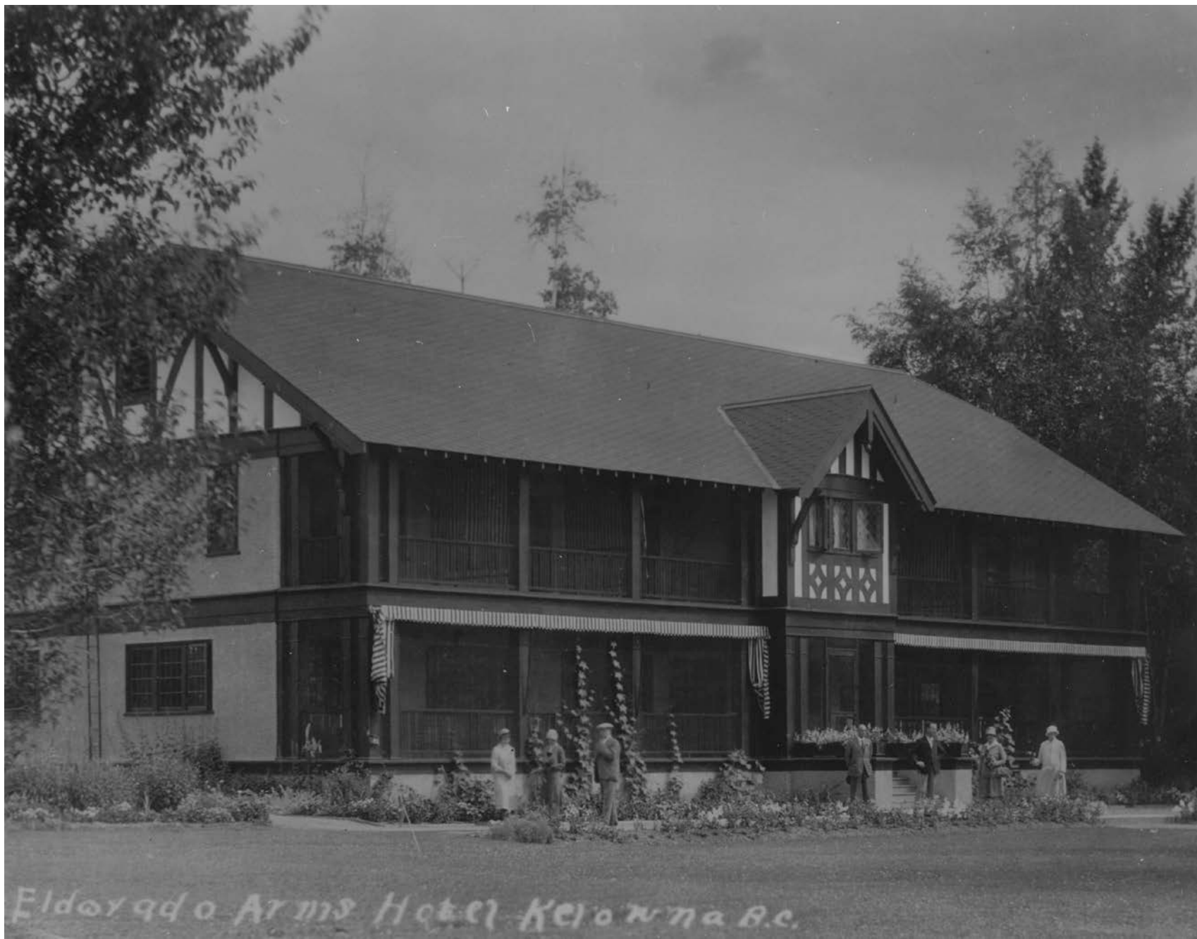
Eldorado Arms Hotel, c. 1920's