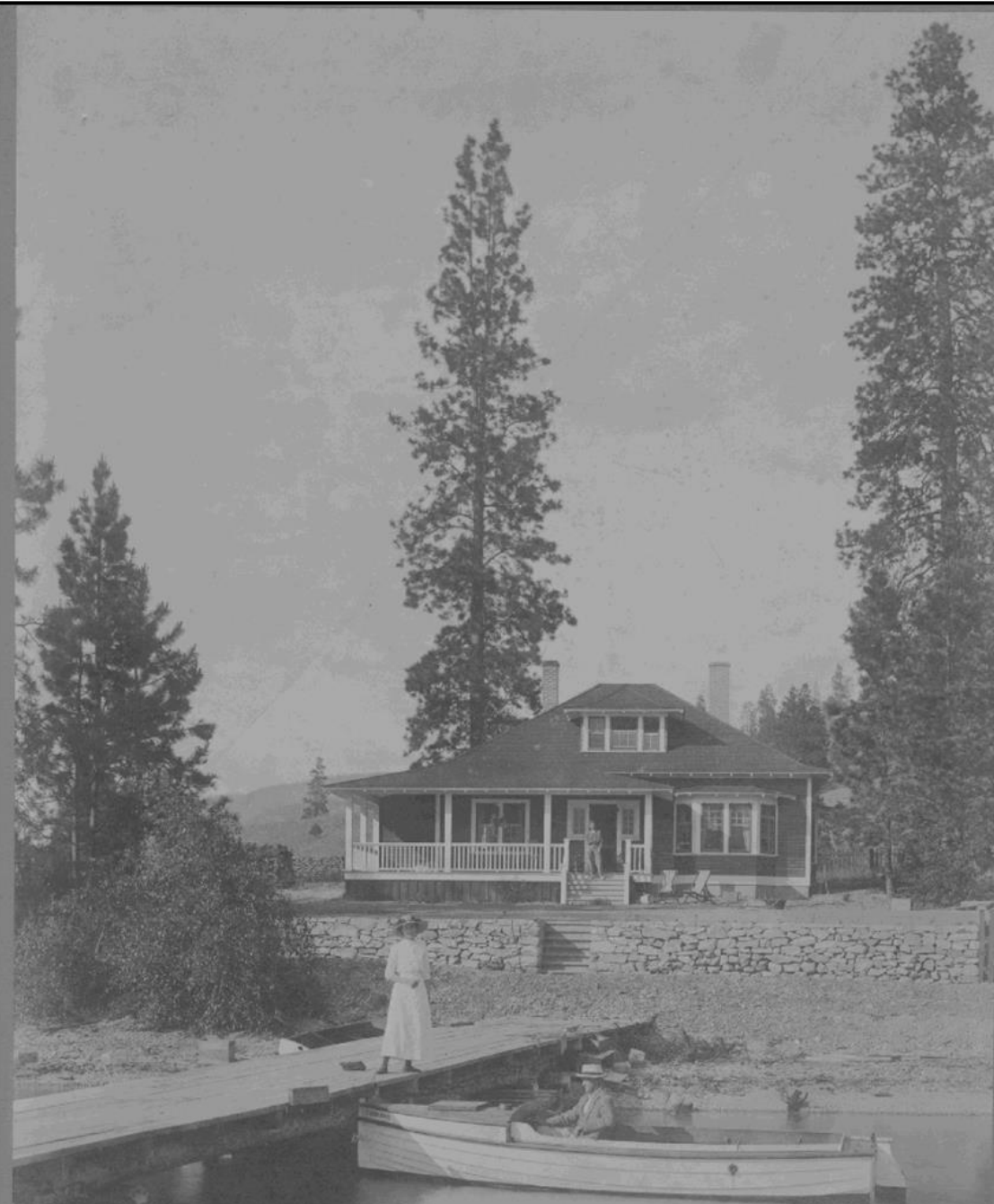
Gibson House, Lake Country