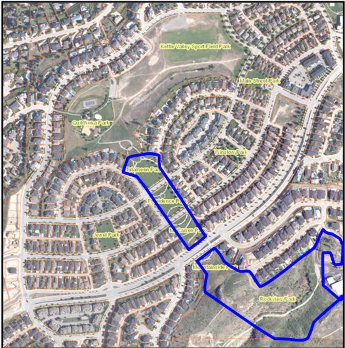
Attachment B: Kettle Valley Park System – Overview Photograph January 8, 2016