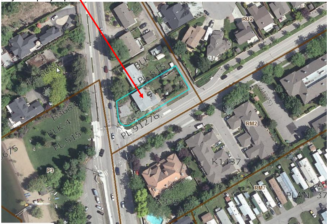
Subject Property Map: