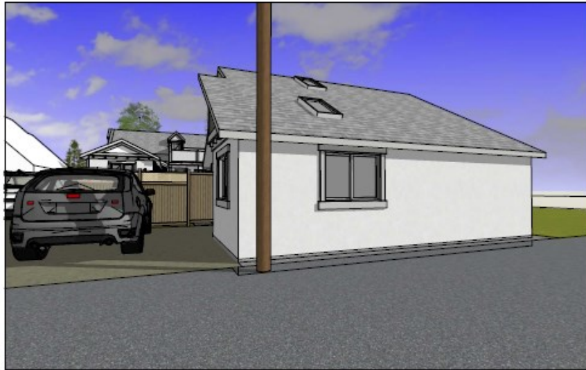
3 PROPOSED SOUTH PERSPECTIVE N.T.S.