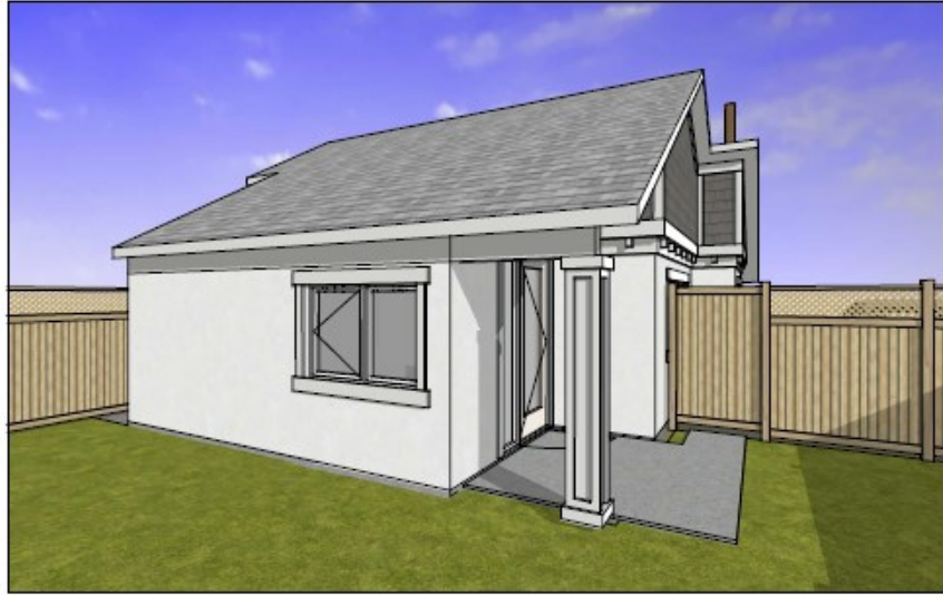
1 PROPOSED NORTH PERSPECTIVE N.T.S.