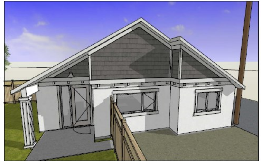
4 PROPOSED WEST PERSPECTIVE N.T.S.