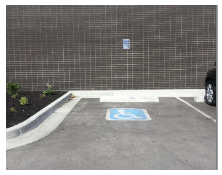
Recommendation 1 Maintain painted lines + signage (e.g. Kelowna RCMP)