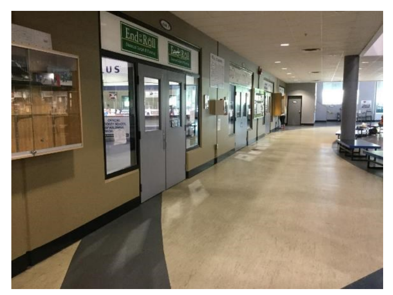
Pattern/glare free flooring – Capital News Centre