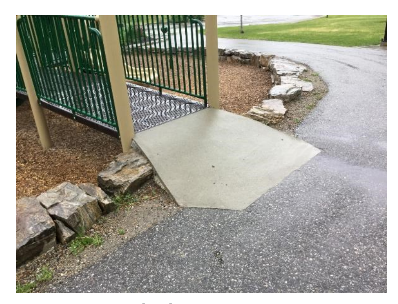
Recommendation 3 Pathway to amenities (e.g. Blair Pond Park)