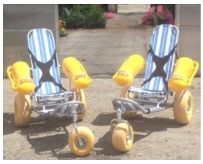
Access for all - Beach wheelchairs