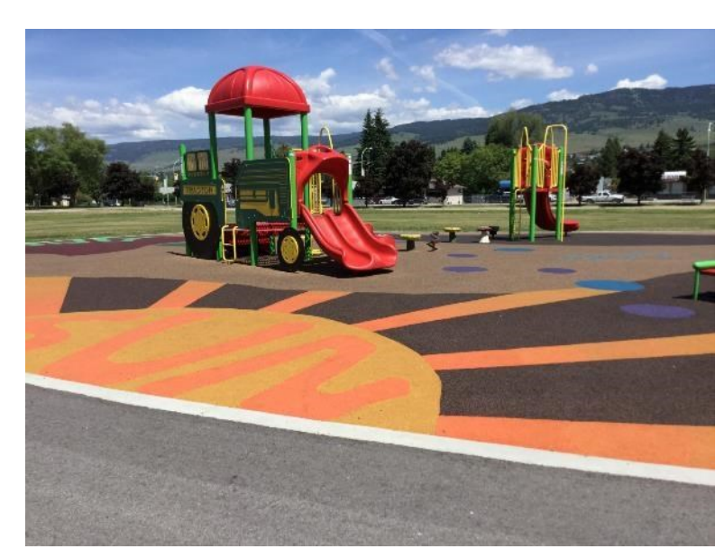
Inclusive play - Rutland Centennial Park