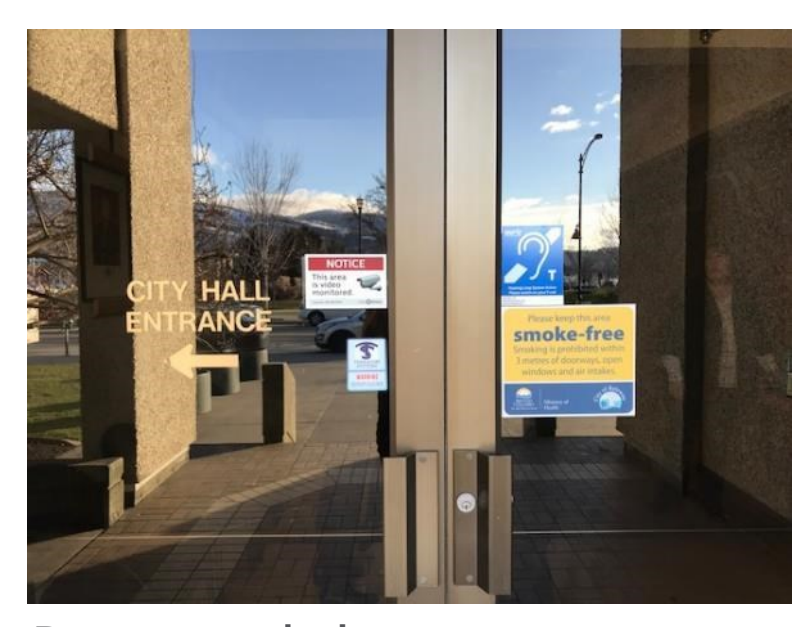
Recommendation 9 Assistive listening system / hearing loop (e.g. City Hall Council Chambers)