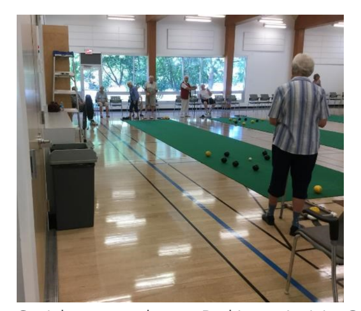
Social connectedness – Parkinson Activity Centre