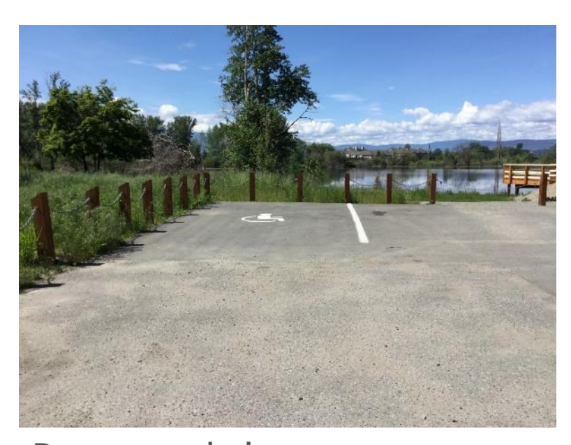
Recommendation 1 Designated accessible parking (e.g. Munson Pond Park)