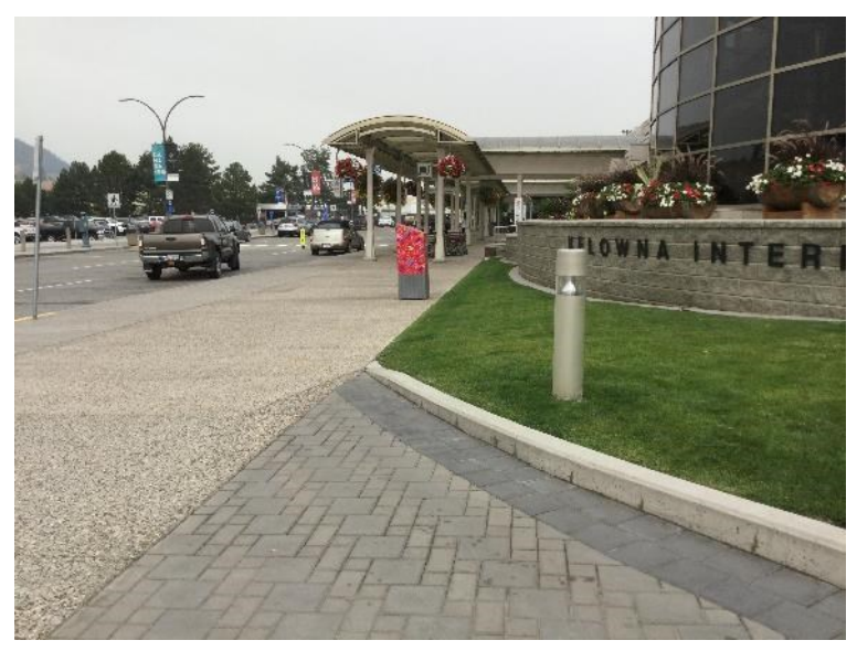
Automated doors at entry – Kelowna International Airport