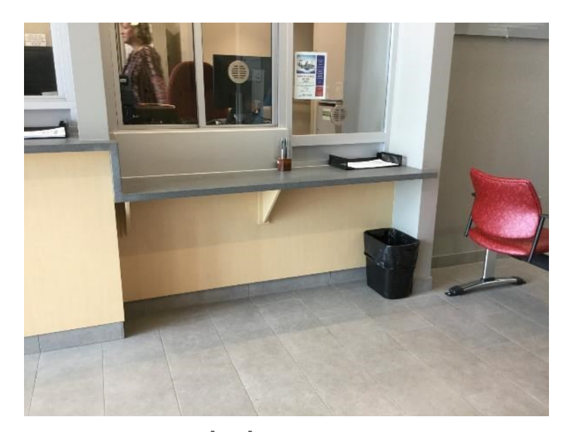
Recommendation 7 Lowered service counter (e.g. Kelowna RCMP)