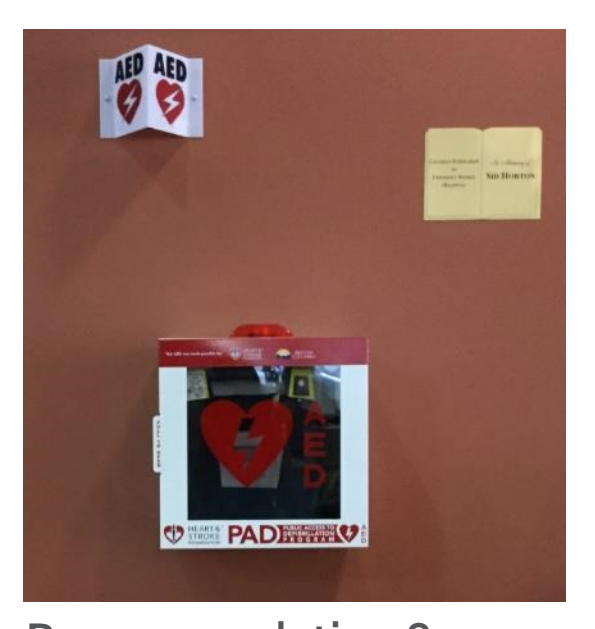
Recommendation 8 Automated external defibrillator (AED) (e.g. Okanagan Regional Library – Kelowna)