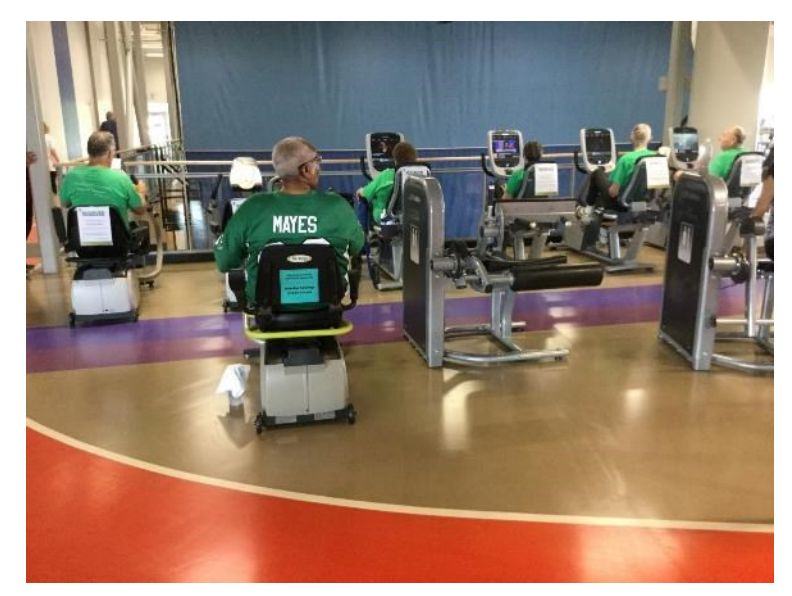
Inclusive fitness – Kelowna Family YMCA