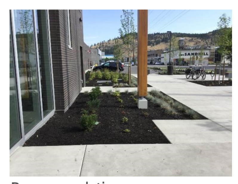
Recommendation 3 Pathway to building (e.g. Kelowna RCMP)