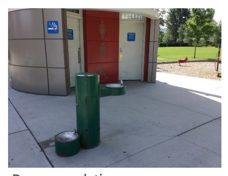
Recommendation 4 Year round washroom (e.g. Gertsmar Park)