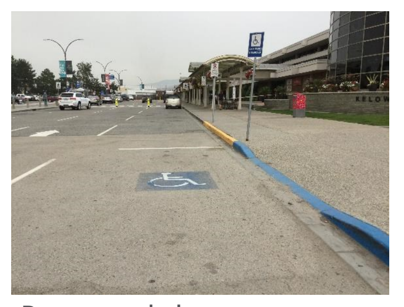
Recommendation 2 Passenger loading zones (e.g. Kelowna International Airport)