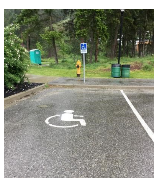
Recommendation 2 Maintain painted lines + signage (e.g. Blair Pond Park)