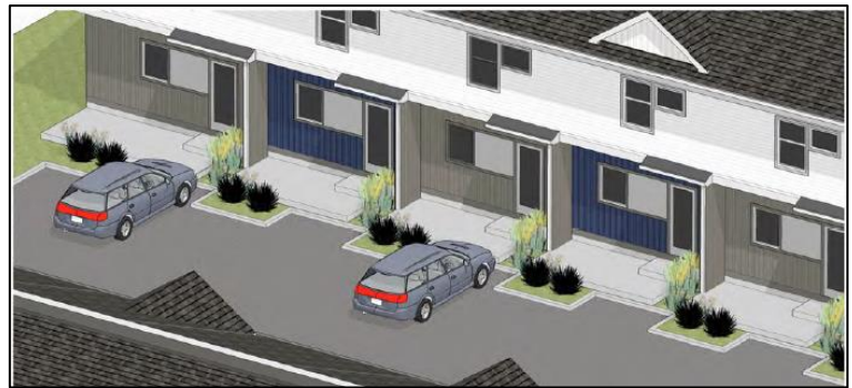
Figure 3: Detailed view of Interior parking showing access to private patios & parking

The development proposal is for a rental row housing project. The project contains two, 2 storey blocks of row houses each side of a central parking plaza is proposed. The row fronting Nickel Rd will provide seven, 2 bedroom units with two, 2 bedroom + den units at either end. These units will have unfinished basements for unit equipment (furnace/ HWT/ HRV) and tenant storage. The back row will provide 8, 3 bedroom units with two, 3 bedroom + den units at either end. These units will have basements finished to provide a bedroom, rec room, and washroom and will include unit equipment (furnace/ HWT/ HRV). The central parking area will allow 2 parking spaces per unit. All units will have 'front' and 'back' doors such that parking area and outdoor private patios and yards may be directly accessed.