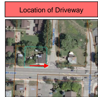
Location of Driveway

The solution was to provide a private easement through the private parking lot for the potential redevelopment of 1220 Hwy 33 West. From a site design perspective this proposal utilizes the available space on the subject property most efficiently.