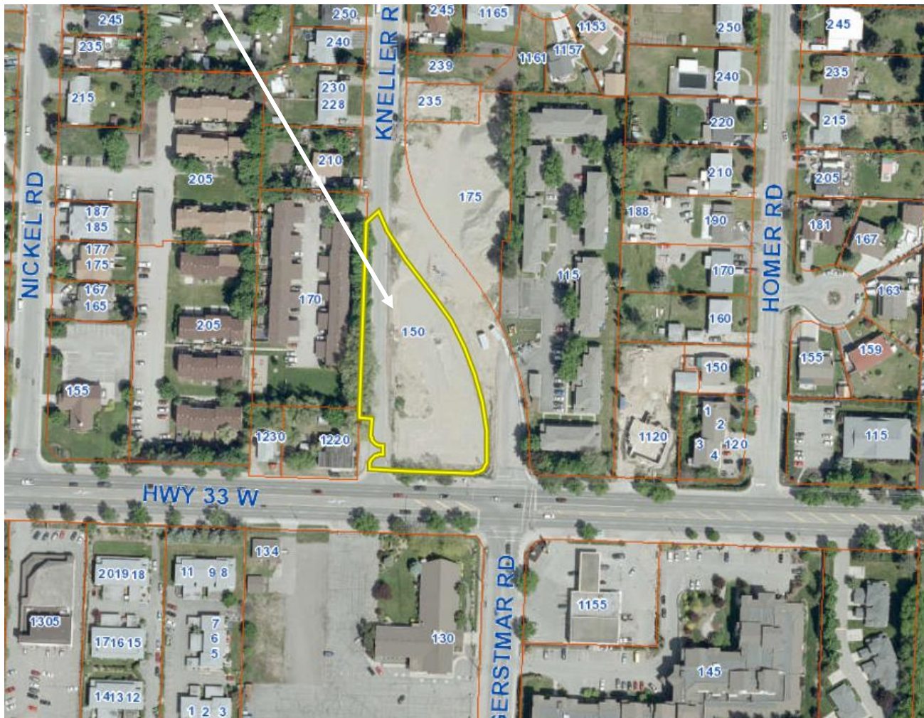
Subject Property Map: 1170 Hwy 33 W