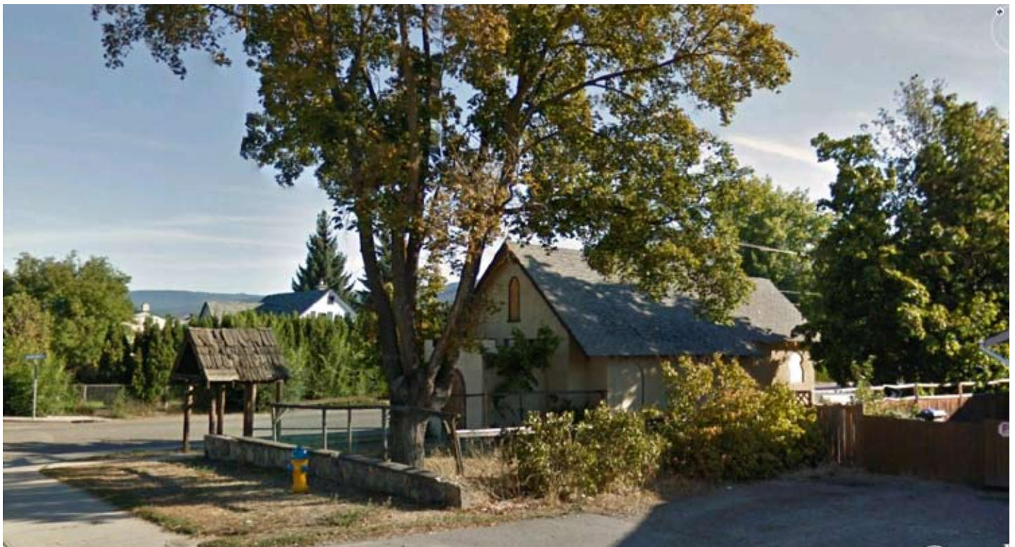
Southwest view of St. Aidan's Church with lych gate and rock wall, 2013

St. Adain's Church is a listed historic resource on the municipal heritage register. The heritage value of the historic site is embodied in character-defining materials, forms, location and spatial configurations. These elements should be preserved during interventions, if possible, in order to retain the heritage character and value of the historic site.