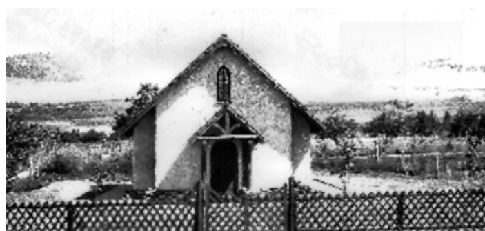
West elevation, 1933