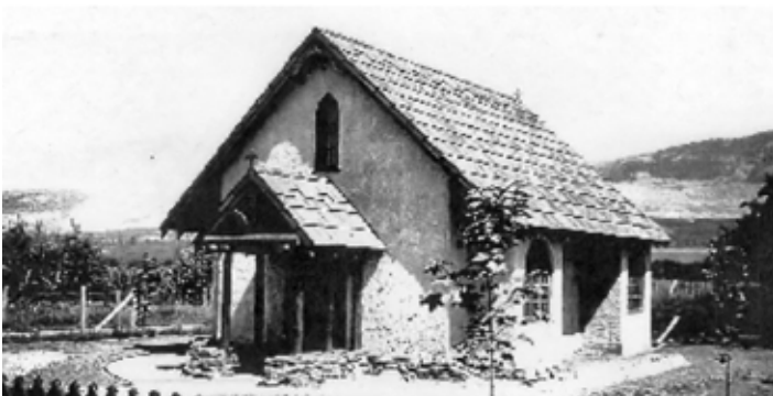
Southwest elevations, 1933