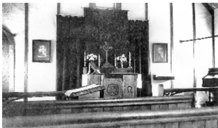
View of altar, 1933