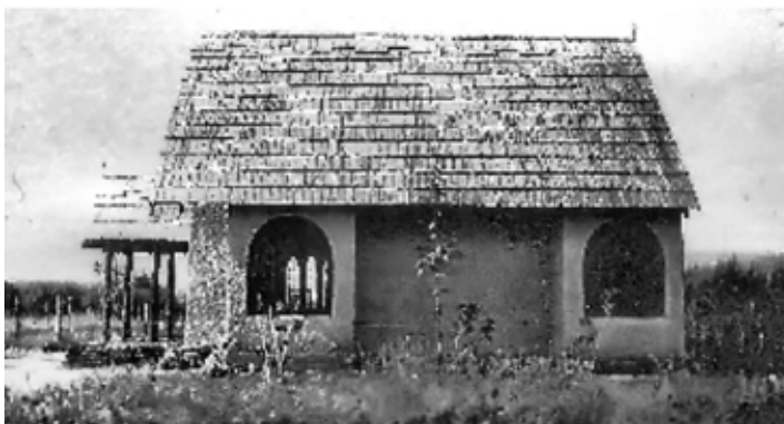
South elevation with original wooden porch, 1933