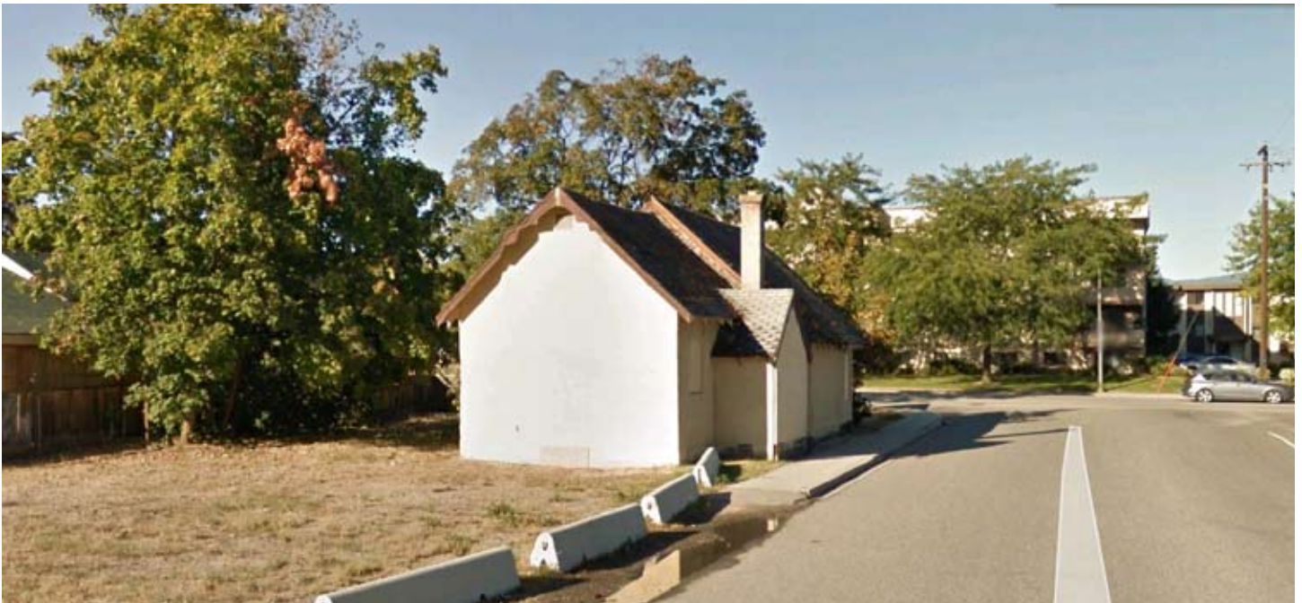
View of northeast elevations, 2013