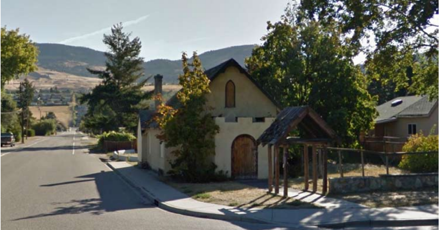
St. Aidan's Church looking east, 2013