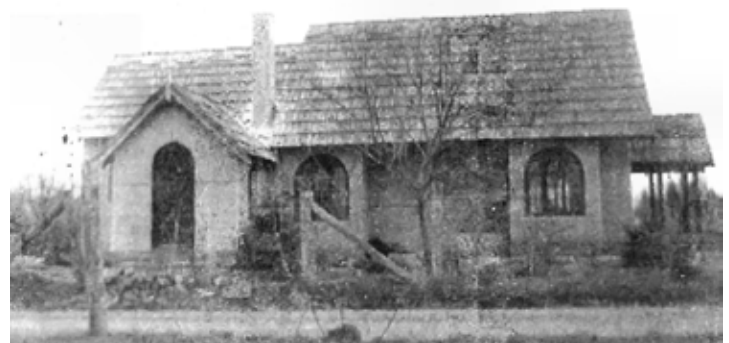
North elevation with chimney and vestry, 1938