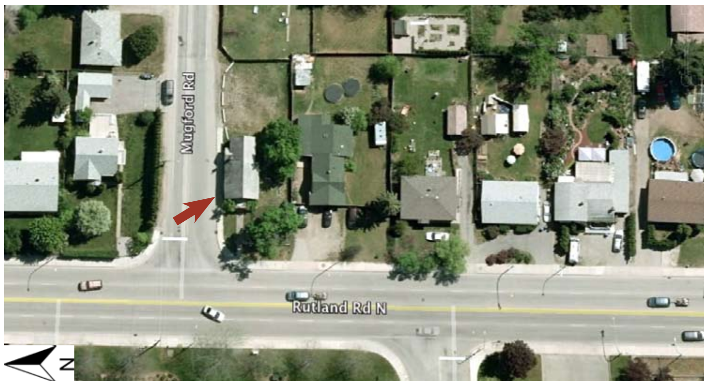
Prominent corner location of St. Aidan's Church in Rutland, 2013

Early alterations in 1938 included the addition of an east-facing chancel entered through a Norman arch, a later removed vestry on the north façade and an interior stucco-clad chimney.