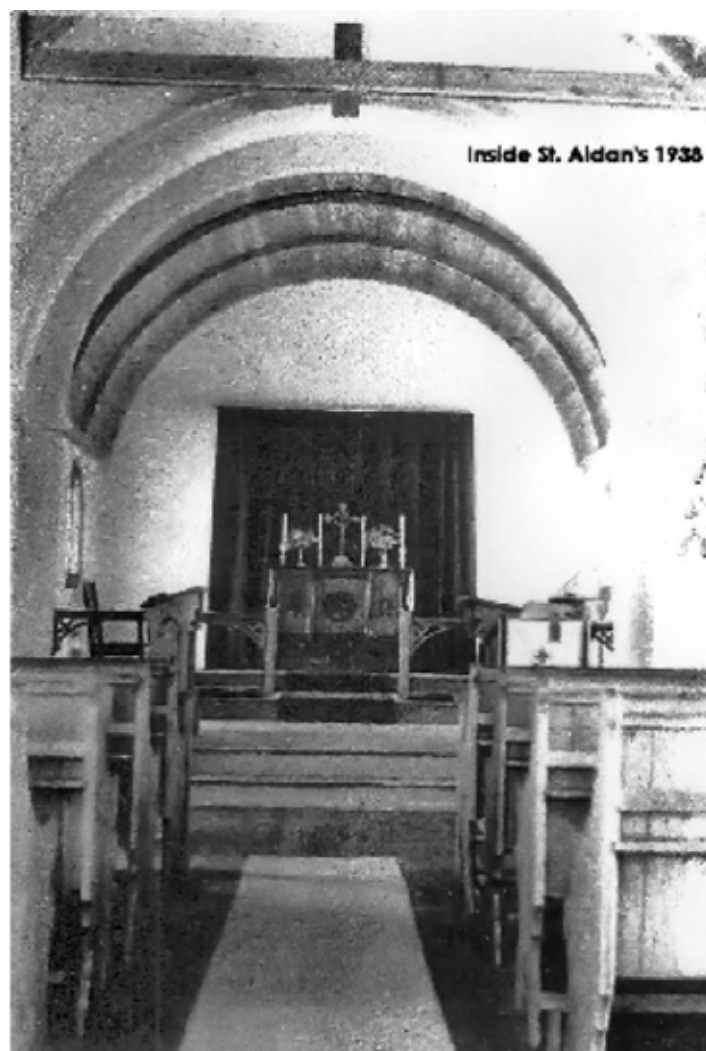
Interior view with Norman arch , 1938