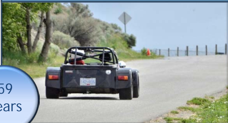
Knox Mountain Hill Climb