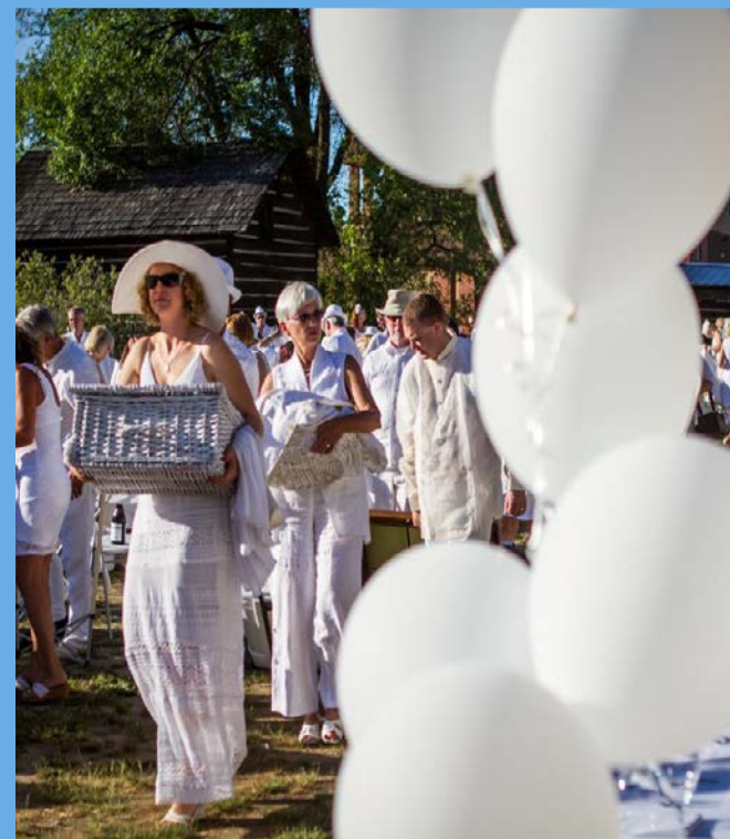
Diner en Blanc - Okanagan