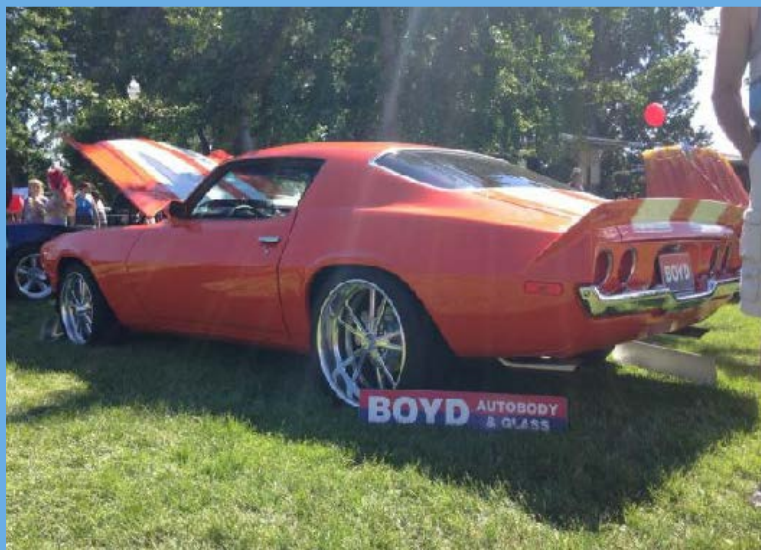
Father's Day Car Show