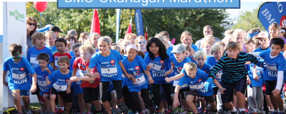
BMO Okanagan Marathon