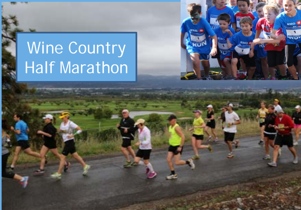
Wine Country Half Marathon