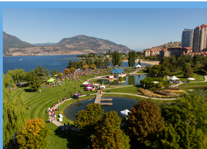
Okanagan Beer Festival