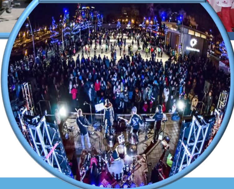
New York New Years