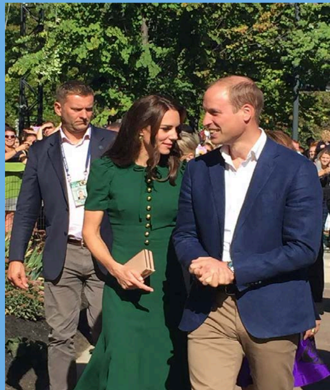
The Royal Visit