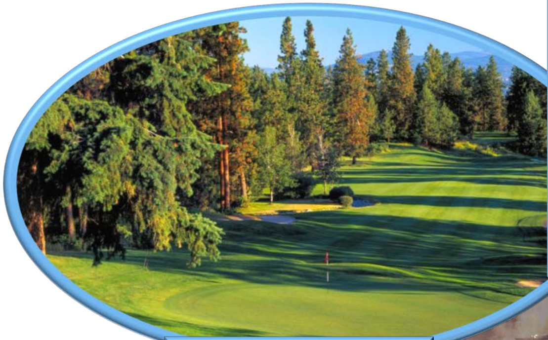
Mackenzie Golf Tour