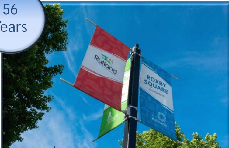
Rutland May Days