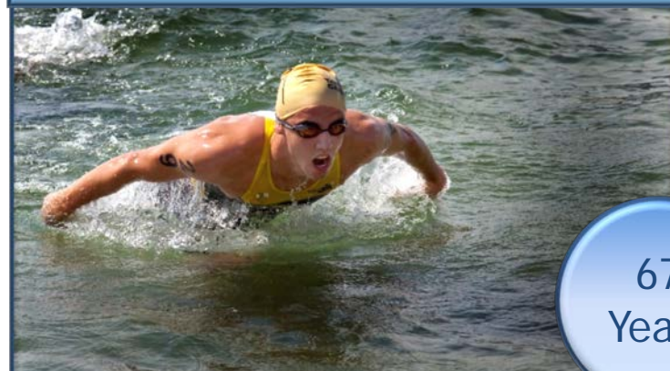
Across the Lake Swim