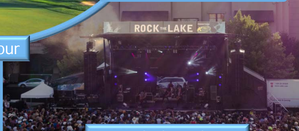
Rock the Lake