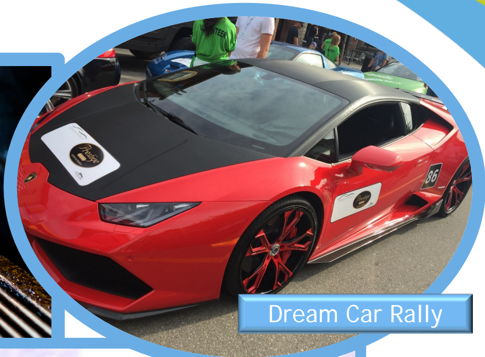
Dream Car Rally