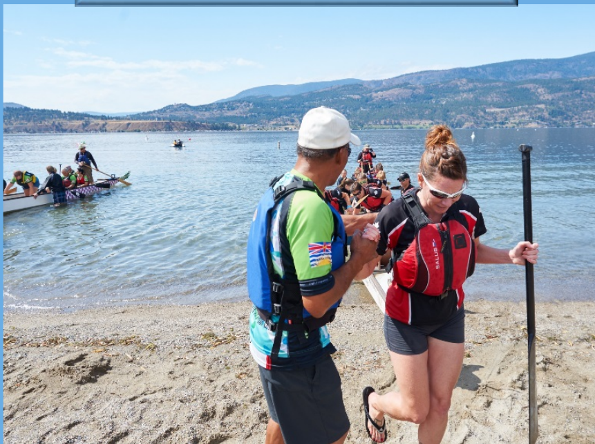
Paddle for Prevention