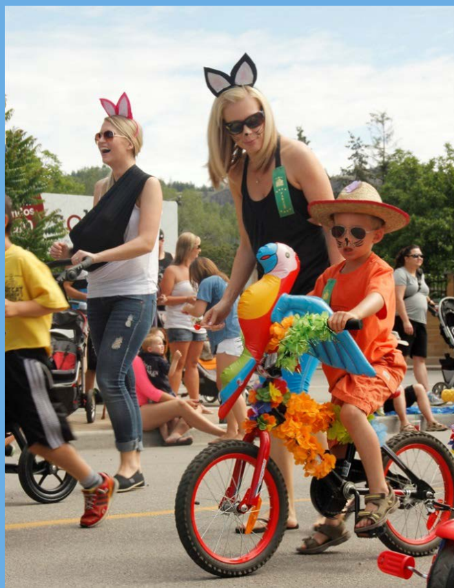
Fat Cat Children's Festival