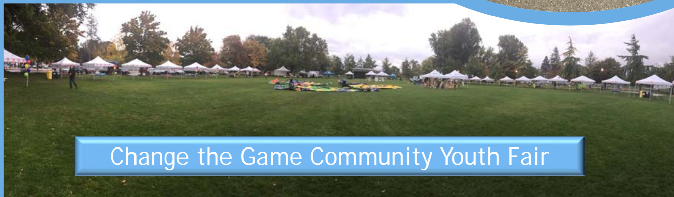
Change the Game Community Youth Fair